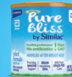
Pure Bliss® by Similac**†‡