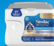
Similac® 360 Total Care**†‡