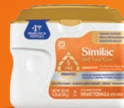
Similac® 360 Total Care® Sensitive**†‡