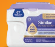
Similac Pro-Total Comfort**†‡