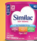
Similac® Soy Isomil®